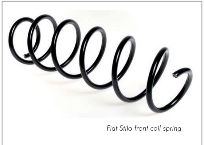
Fiat Stilo front coil spring

On both pictures the spring has been compressed to a length of 200mm, rebound is 280mm. In this test the spring was fitted with the top spring plate in the correct position and then with the plate twisted out of position by 180 degrees.